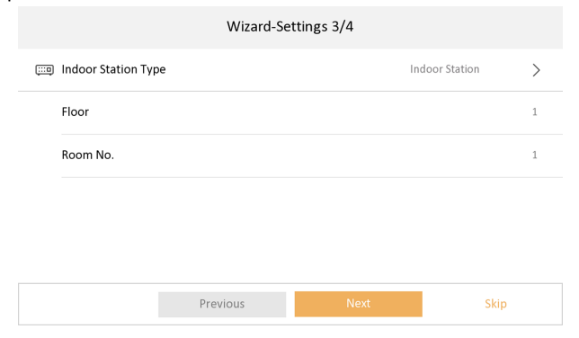
Figure 1-4 Indoor Station Settings

4. Linked related devices and tap Next. If the device and the indoor station are in the same LAN, the device will be displayed in the list. Tap the device or enter the serial No. to link.