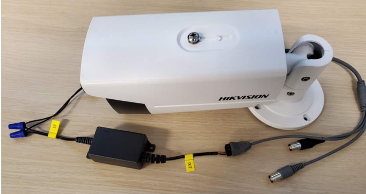
Figure 3, AC Filter Installed