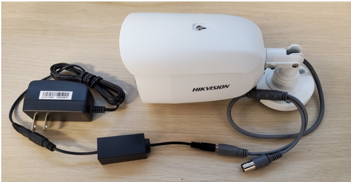
Figure 2, DC Filter Installed

Figures 2 and 3 show the connected DC and AC filters respectively: